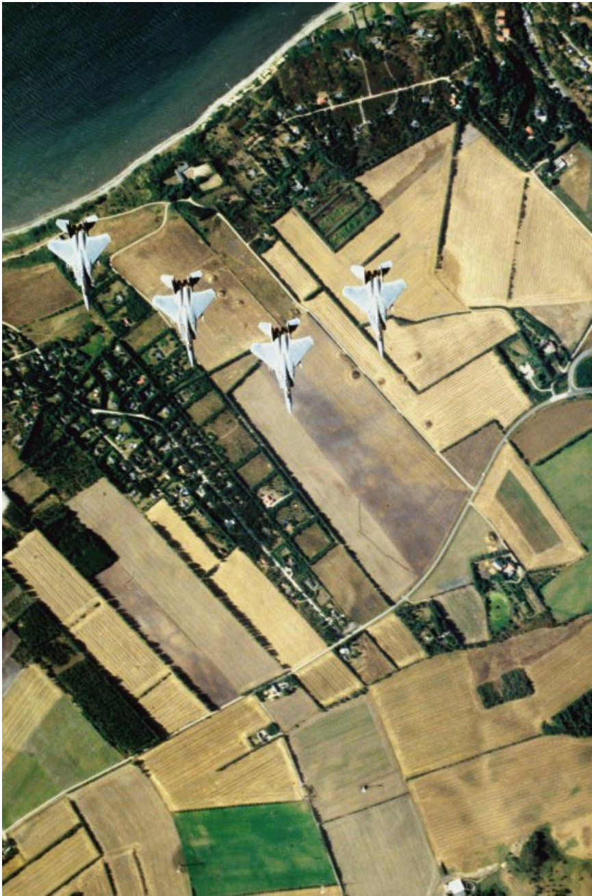
Air superiority is essential for successful military operations, including strategic attack.