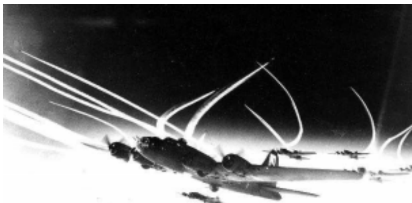
Boeing B-17 with fighter escort.

accomplished the intermediate objective to destroy the German fighter force and the Allies were able to conduct the Normandy landings virtually unopposed by the Luftwaffe . Germany had concentrated two-thirds of the Luftwaffe to oppose the strategic air offensive and was literally destroyed when it flew in the face of the heavily armed bombers and their highly capable fighter escorts.