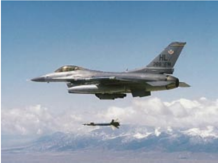
The F-16 is capable of conducting strategic attack.

electrical power production and distribution, resulted in the virtual paralysis of national leadership.