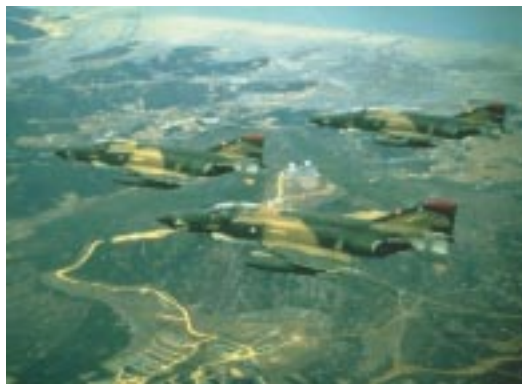
A formation of Vietnam-era F-4 Phantom IIs.

The Vietnam conflict began the change in how airpower planners thought about the use of fighters and heavy bombers. Heavy bombers, the weapons of choice for World War II strategic warfare, were