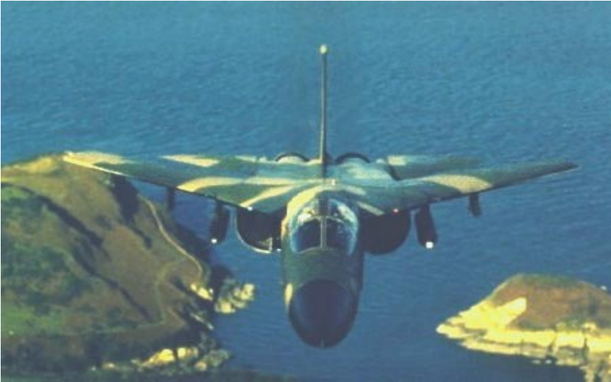
F-111s flew from the United Kingdom to strike targets in Libya during Operation EL DORADO CANYON.

military structure or a transnational threat, such as a state-sponsored terrorist organization. Regardless of the opponent, the purpose would be the same—to directly achieve national or theater strategic objectives (or thwart an opponent's objectives) without having to first resort to classic attrition warfare.