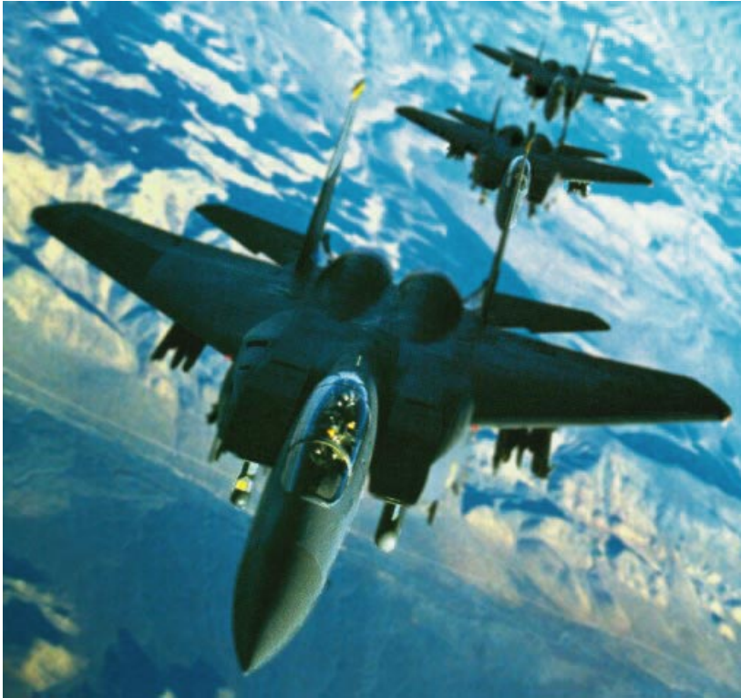
The F-15E contributes massive firepower to the strategic attack function with laser-guided weapons and standoff missile precision.

tiple sets of targets or systems simultaneously. Iraq's infrastructure was attacked in parallel resulting in operational paralysis for the remainder of the war. Though objectives may be addressed in a series if necessary, the air component commanders should use care not to compromise the overall mass and shock effect of aerospace power as enhanced by stealth, precision weapons, and enhanced command, control, and intelligence capabilities. Parallel attacks preserve these characteristics and increase the effectiveness of the air operation as a whole.