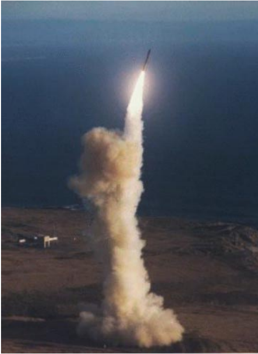
Launch of a Minuteman III.

on JFACC recommendations and the conditions in the JFC's area of responsibility. Apportionment will likely change as the campaign progresses or as the operational situation changes. Early in a campaign the effort may center on counterair and strategic attack. An enemy ground offensive may then necessitate a larger percentage of the total effort be dedicated to close air support (CAS) over strategic attack. If a situation develops that would change target priorities (i.e., Iraq's attack on Khafji), air and space forces can respond almost immediately due to their flexibility.