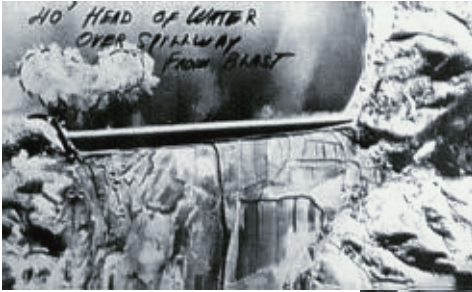
Chasan Dam during (left) and after (below) the May 1953 attacks.