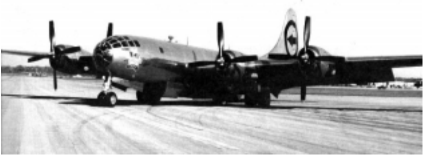
Bock's car: The B-29 that dropped the atomic bomb on Nagasaki.

Japan's major cities in an attempt to destroy both national morale and the economic structure that fed parts for its war machine from small "back-yard" suppliers imbedded in the urban structure. The effects were devastating as one city after another was gutted under an umbrella of American air superiority over the Japanese homeland. Mines dropped from B-29s trapped ships in Japanese harbors and paralyzed shipping along the Japanese coast, the Inland Sea, and the Sea of Japan. The air and naval stranglehold over Japan's lines of communication produced a lack of parts and fuel that grounded Japanese airpower and left the remnants of its navy bottled up in port.